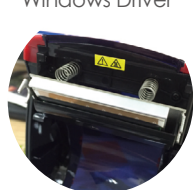
Printer Head Quick Replacement